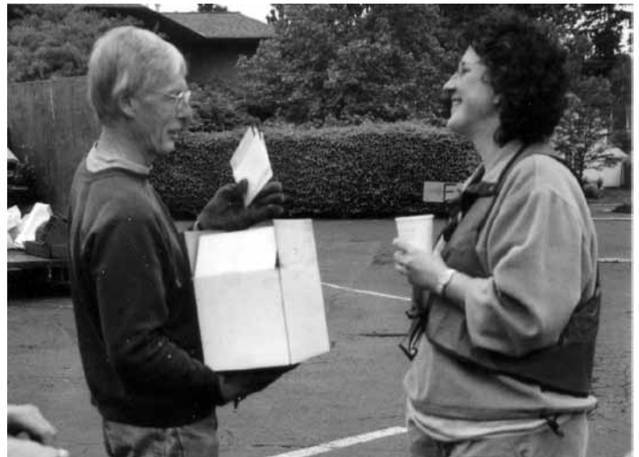
Clean-up volunteers have fun & snacks, help neighbors dispose of their garbage, and explain sorting and disposal options.